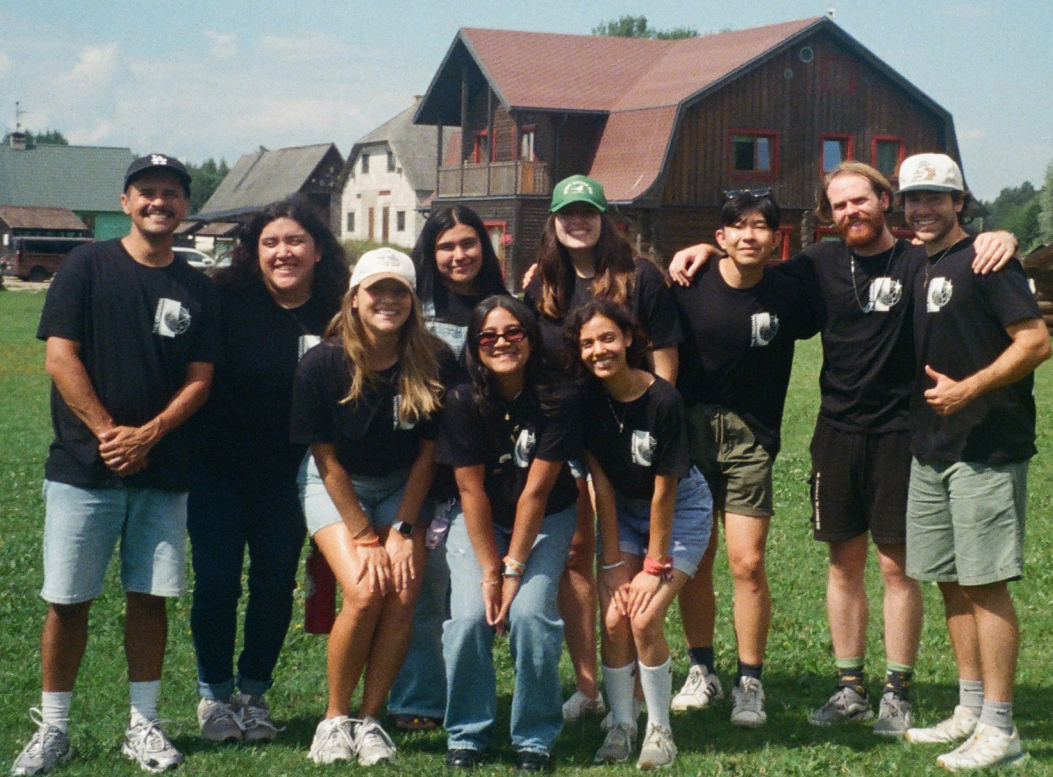
Team of young adults serving in Estonia.